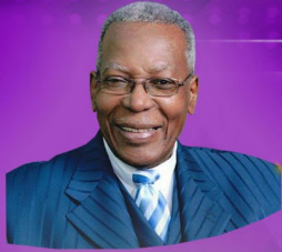
Eugene Lawton Minister