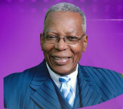
Eugene Lawton Minister